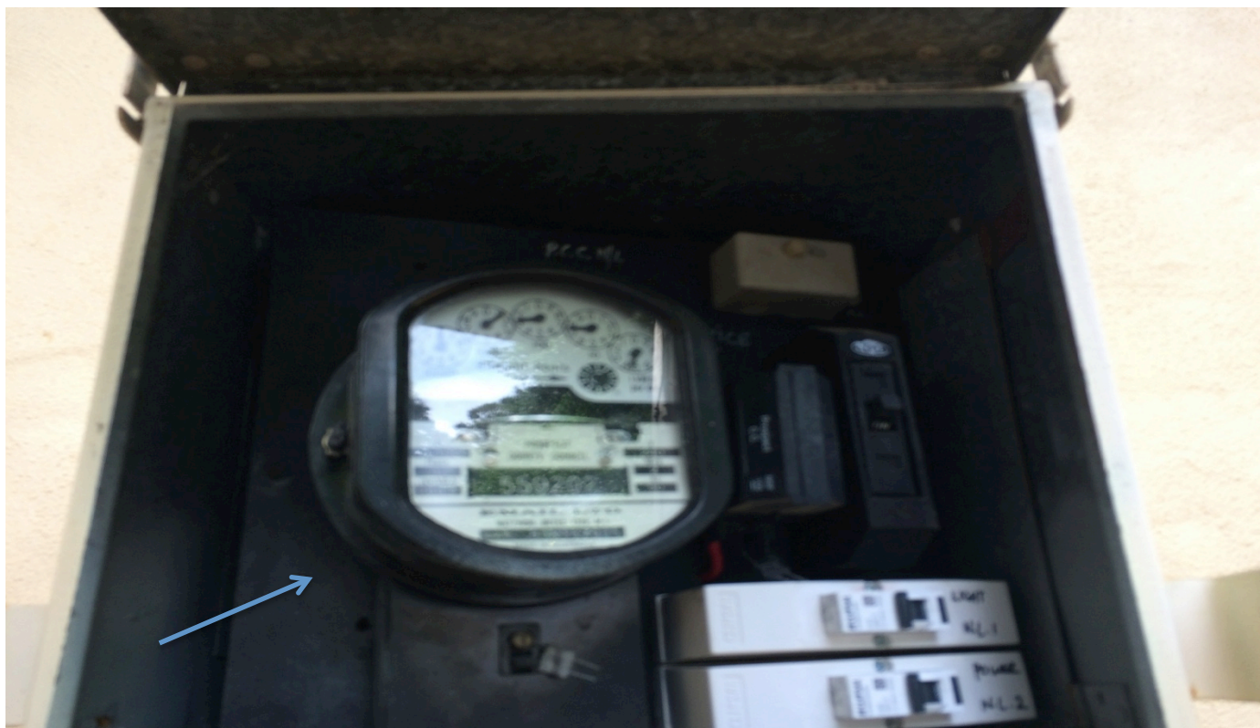
Photo 125: Electrical backing board containing asbestos on the northern perimeter of the Mount Irvine Rural Fire Station.