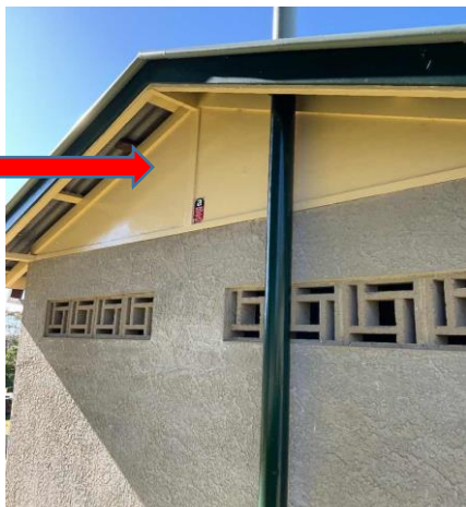
External, GF, Exterior, Gable Linings - Fibre cement sheet, Chrysotile, Amosite and Crocidolite asbestos, Previously sampled 37272-89