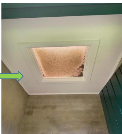
Internal, GF, Toilets, Ceiling Linings - Fibre Cement Sheet, No Asbestos Detected, Previously sampled 37272-91