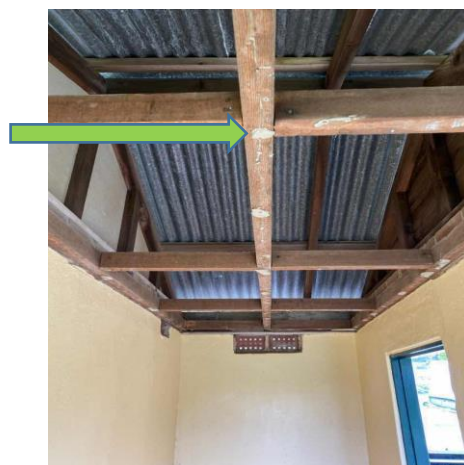
Internal, GF, Storage Area/Walkway, Ceiling Linings - Fibre Cement Sheet, No Asbestos Detected, Previously sampled 37272-90