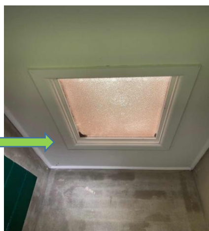
Internal, GF, Toilets, Ceiling Linings - Fibre Cement Sheet, No Asbestos Detected, Previously sampled 37272-91