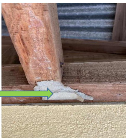
Internal, GF, Storage Area/Walkway, Ceiling Linings - Fibre Cement Sheet, No Asbestos Detected, Previously sampled 37272-90