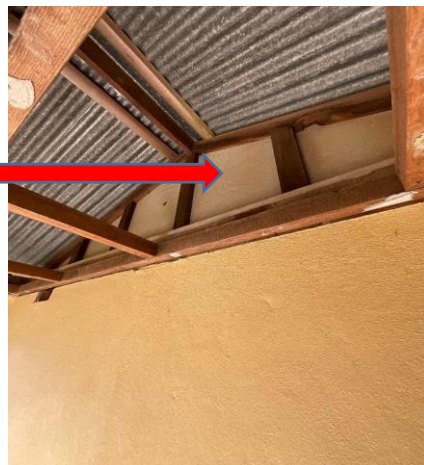
External, GF, Exterior, Gable Linings - Fibre cement sheet, Chrysotile, Amosite and Crocidolite asbestos, Previously sampled 37272-89