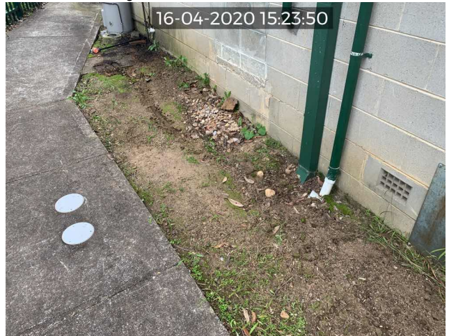
Stage 2 : Surface below removal area western side