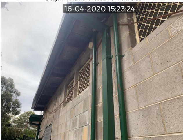
Stage 2 : Removal area western side