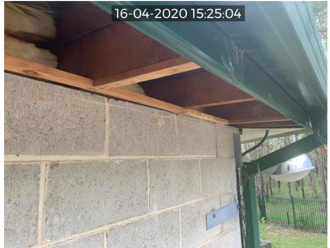
Stage 2 : Removal areas southern side