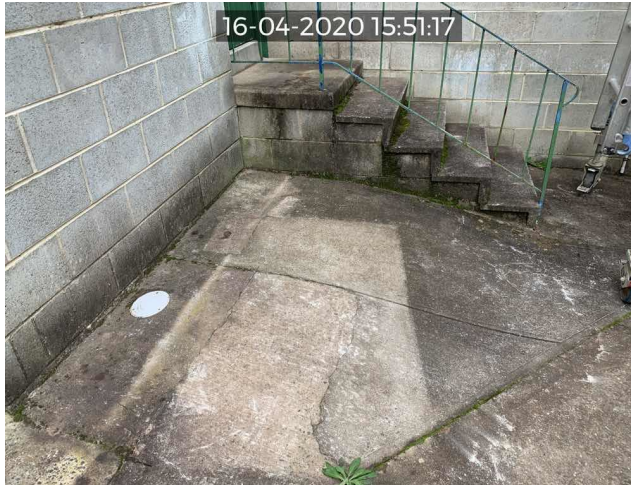
Stage 2 : Surface below work area southern side