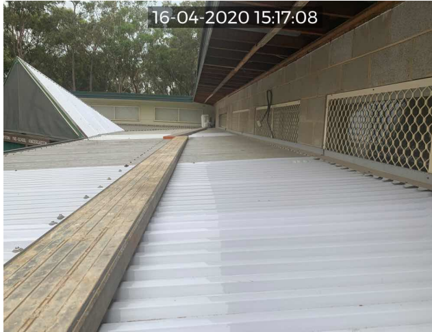
Stage 2 : Surface below removal area eastern side