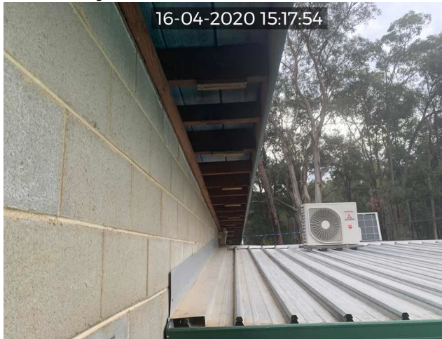
Stage 2 : Removal area northern side