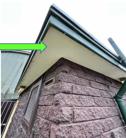
External, GF, Exterior, Eaves - Fibreboard, No Asbestos Detected, Similar to 37272-77 - Assumed negative