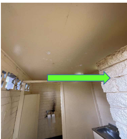
Internal, GF, Throughout, Walls throughout - Yellow - Topcoat, Lead Not Detected (<0.001%w/w), 432937/LP01