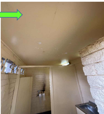
Internal, GF, Men's Bathroom, Ceiling Lining - Fibreboard, No Asbestos identified, 37272-77