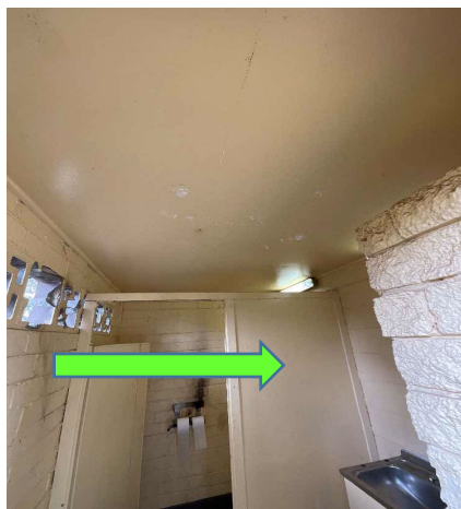
Internal, GF, Men's Bathroom, Wall Lining - Fibreboard, Assumed Negative, Similar to 37272-77 - Assumed Negative