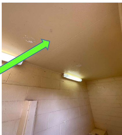
Internal, GF, Women's Bathroom, Ceiling Lining - Fibreboard, Assumed Negative, Similar to 37272-77 - Assumed Negative