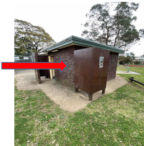
External, GF, Exterior, Walls - Brown - Topcoat, Lead Detected (1.0%w/w), 432937/LP02